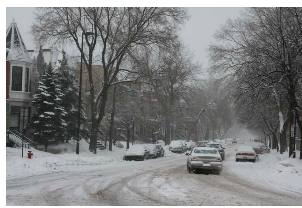
Driving in winter is a question of common sense: drive slower, maintain a longer distance, brake sooner and very progressively, do not accelerate roughly.

You can have updated information about traffic conditions on the website <a href="http://www.quebec511.gouv.qc.ca/fr/index.asp">http://www.quebec511.gouv.qc.ca/fr/index.asp</a> or call 511.