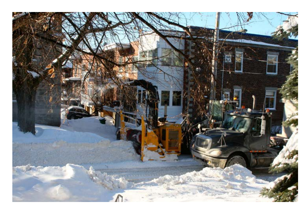
Main roads; security services, hospitals, bus lanes, subway accesses, schools, street with a steep incline, etc. are cleared first. The clearing time also depends also on the snow's density.

When the City of Montreal takes away the snow on the streets (one side at a time), they place orange "No Parking" panels. These are usually placed at about noon, with snow removal starting at 7 pm. Once snow removal starts, any parked cars are immediately towed away. The tow trucks will give warnings by way of a continuous siren, a very original sounding siren and totally annoying!