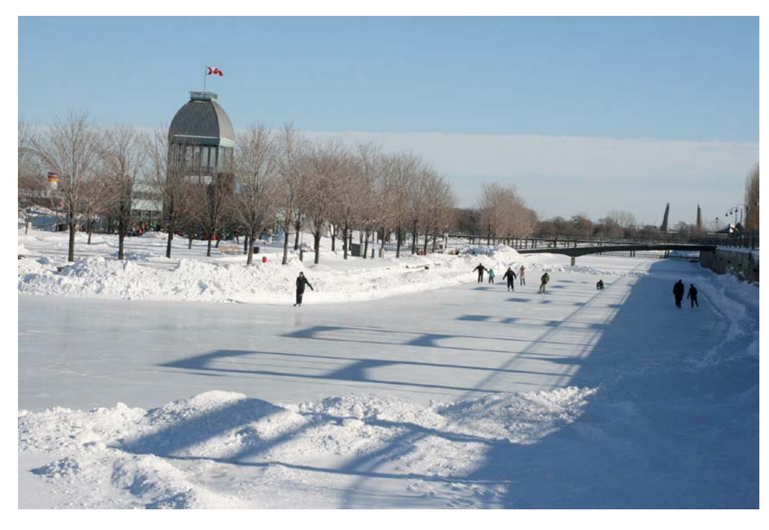
Ice skating on the Saint-Laurent River... Magical!