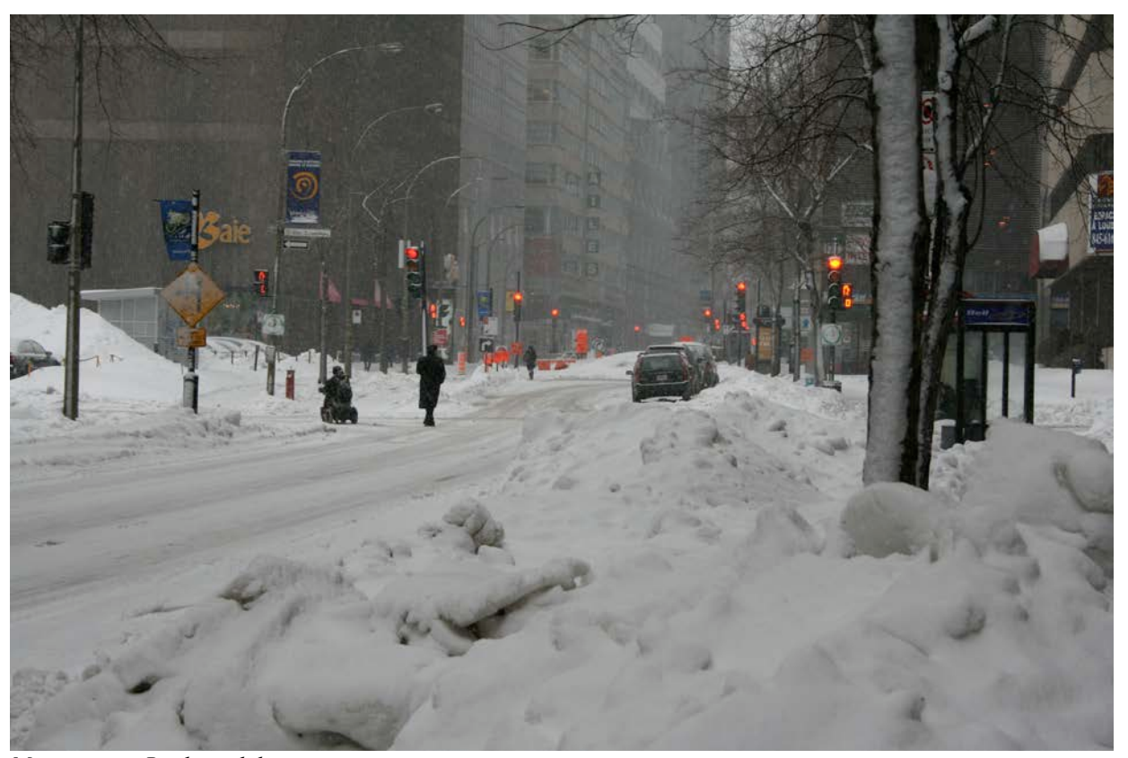
Maisonneuve Boulevard during a snowstorm.

The fact that it is cold is due to three phenomena: the continental position of the city; the influence of the (cold) sea current from Labrador and polar air descending south without any mountain range to stop it.